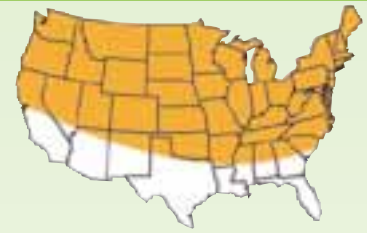
■ Area of Primary Adaptation